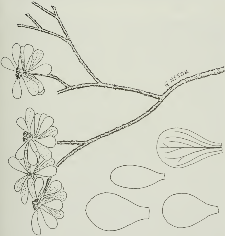
Figure 1. Pacifigeron rapensis . Habit and leaf variation, showing pattern of venation.